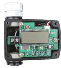
SPTM-5VL LCD Included