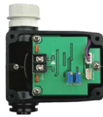
PTM-5VL Analog type