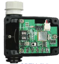
SPTM-5VL Smart type